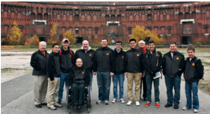
Germany NLS staff contingent