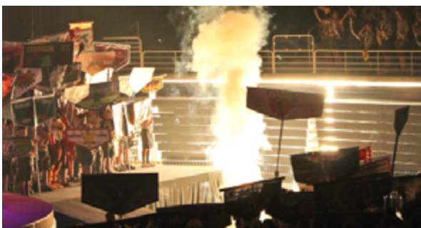
Parade of Flaps