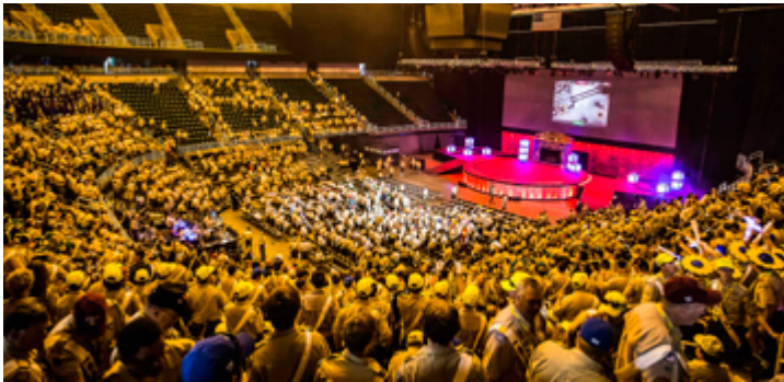
Overview of NOAC Shows

The next NOAC will be taking place in 2015 and will be back at Michigan State University. We hope to see you there!