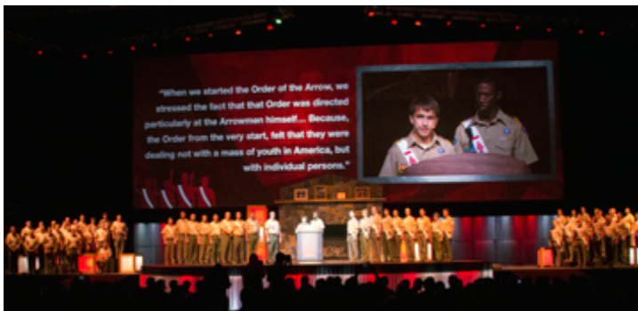
DSA Class of 2012