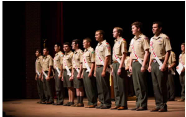
Conference Vice Chiefs